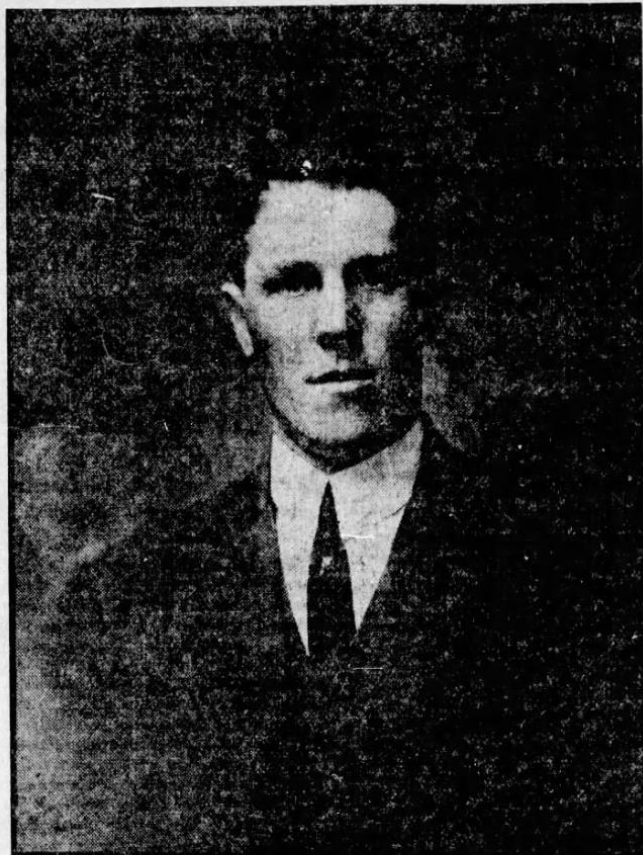
Latest member of Colts' pitching staff. He comes from the Canadian League.