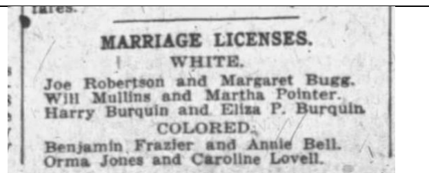
The Tennessean (Nashville, TN) August 28, 1910: 15