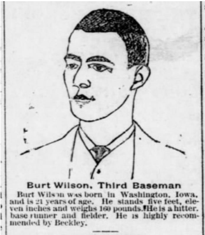
Leavenworth Standard Feb 4, 1887